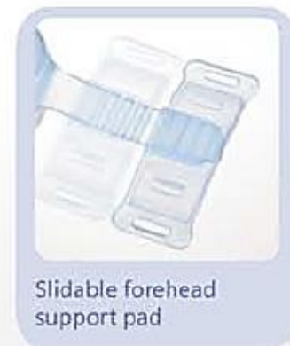
Slidable forehead support pad

"40% lighter compared to most common models on the market."