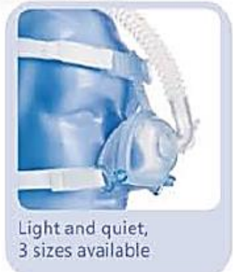
Light and quiet, 3 sizes available

Made of lightweight, durable plastic material and adjustable forehead support, designed to fit comfortably and improve sleep quality. Ergo seal and forehead pad to reduce air leakage and eliminate pressure sore, maximizing therapy efficiency and compliance. Special vent port, designed to reduce air turbulence and ambience noise level, giving you and your partner a quieter night sleep.