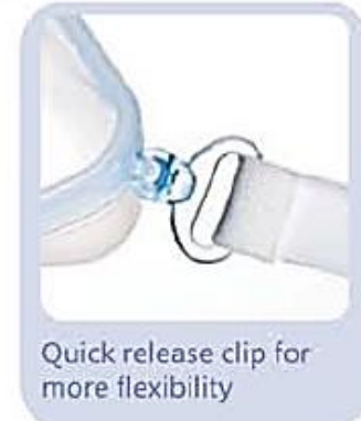
Quick release clip for more flexibility