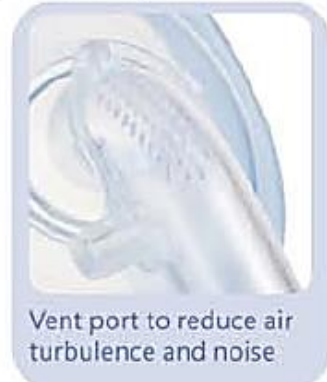
Vent port to reduce air turbulence and noise