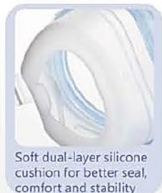
Soft dual-layer silicone cushion for better seal, comfort and stability