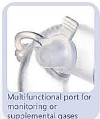
Multifunctional port for monitoring or supplemental gases