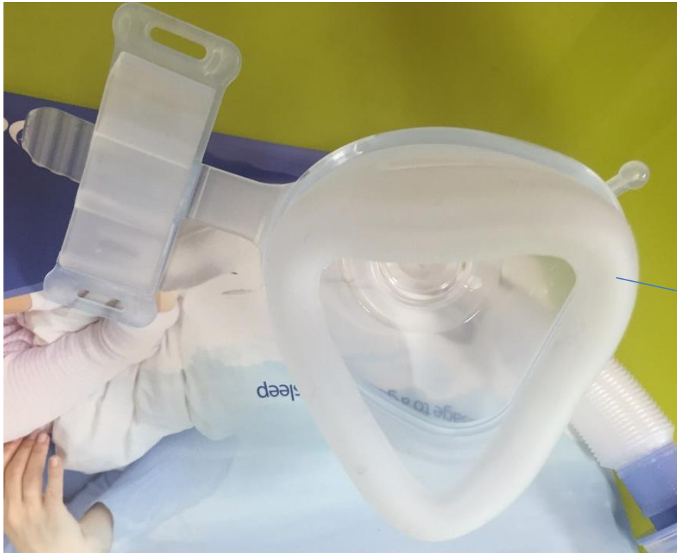
Dual Layer의 매우 부드러운 인체친화적 실리콘 재질의 쿠션